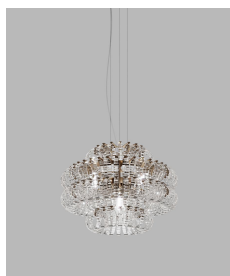
ECOS SP 60C