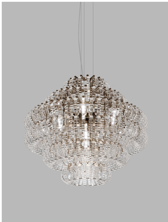
ECOS SP 90 CRRI BS E27 CE